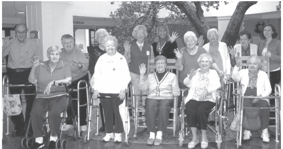
Souderton residents and staff welcome their friends from Dock Woods.

It is exciting and gratifying to see our affiliation continue to progress. Together, I am confident that we will be able to strengthen each campus and extend the reach of Anabaptist senior care services in southeastern Pennsylvania.